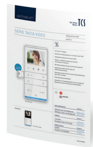
PRODUCT DATA SHEETS All important facts and dimensions