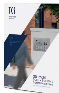
PRODUCT CATALOG 2019/2020 Current products, services and solutions on 88 pages