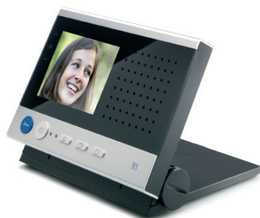
sky on desktop accessory