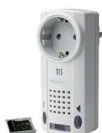
Radio signal unit for series TASTA