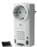
Radio signal unit for series TASTA