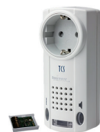
Radio signal unit for series TASTA