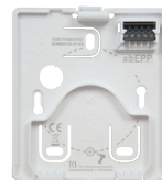
TASTA mounting cover for mounting on wall and flush-mount socket (included in delivery)