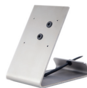
Desktop accessory for TASTA Audio and Video