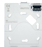
TASTA mounting plate for mounting on flush-mount socket