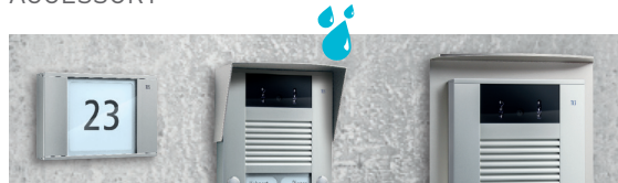
Information field module